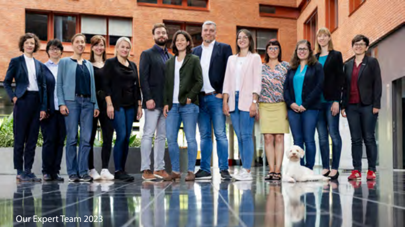
Our Expert Team 2023